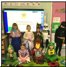
Fantastic costumes were on display at Alburch with Denton Primary Academy

As usual, our schools have excelled themselves in supporting World Book Day and making it a memorable experience for all their pupils. We are pleased to share a selection of photos from St Benet's school's below.