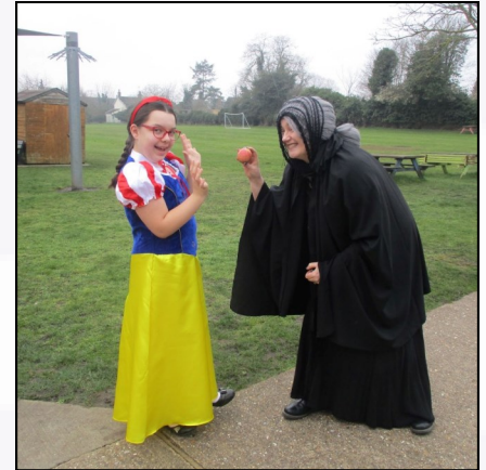
The story of Snow White comes to life at Diss PAP. "Don't eat the apple!"