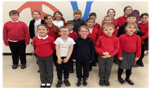
Dickleburgh Eco Council

Last year they completed an environmental review, raised awareness of Cut Your Carbon, audited waste bins, collected natural waste to compost, organised Earth Day, planned their new school garden, ran surveys about laminating and signed up to an ink cartridge recycling programme. Wow!