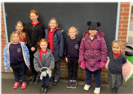
Garboldisham School Council

At Garboldisham they raised money for Banham Zoo and adopted a giraffe called Lulu, and also raised money for the World Wildlife Fund charity.